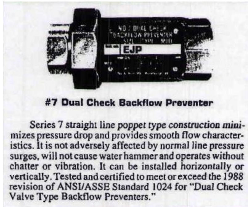
Figure 2 - Dual Check Backflow Preventer