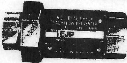
#7 Dual Check Backflow Preventer

Series 7 straight line poppet type construction minimizes pressure drop and provides smooth flow characteristics. It is not adversely affected by normal line pressure surges, will not cause water hammer and operates without chatter or vibration. It can be installed horizontally or vertically. Tested and certified to meet or exceed the 1988 revision of ANSI/ASSE Standard 1024 for "Dual Check Valve Type Backflow Preventers."